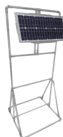
SolarPak Charger (optional)