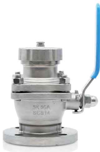
VALPOUR LOCK VALVE