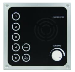
P-3100 CIS Talkback Master Station