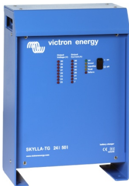
Skylla Charger 24 V 50 A